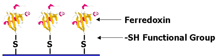
Figure 1. Schematically Structure of Ferredoxin Self-assembly Monolayer

Current-voltage (I-V) measuring unit (SMU Model 236, Keithley, USA) was used as a bias source and current measurement for the ferredoxin self-assembly monolayer. Conducting Au STM tip ( \Psi=1\text{mm} , Sigma Chemical Co., USA) was used as a top electrode for the conductivity measurement. Electrical resistance between STM tip and Au substrate was more than 10\text{ M}\Omega in 0\text{ V} . Current and resistance were measured when the STM tip is moved toward the sample surface. Set point for the STM tip approaching was 0.5\text{ nA} and scan range for the conductivity measurement was 1\sim 1\text{ V} . The topography of ferredoxin self-assembly monolayer was obtained by STM (Auto Probe CP, Park Scientific Instruments, USA). In all experiments, STM was operated in constant height mode at ambient condition. Typical set point, servo gain, and scan rate were 0.5\text{ nA} , 3\sim 5 , and 3\text{Hz} , respectively.